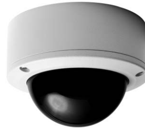
ICS100 SERIES DOME