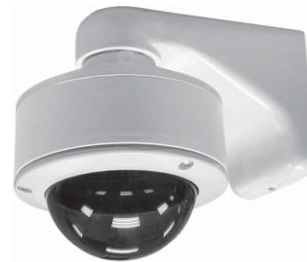
ICS100-PG SHOWN WITH ICS100 DOME AND SWM-GY MOUNT

2 x 2 ft (61 x 61 cm) metal ceiling panel for ICS150 Series in-ceiling dome.