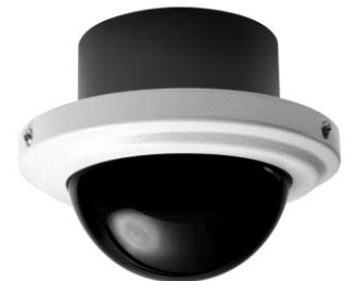
ICS150 SERIES DOME

The 100/150 Series Camclosure® Integrated Camera System integrates a camera and lens package into a small, high-security enclosure. All models are quick and easy to install and are perfect for a variety of indoor and outdoor applications. It is ideal for residential, office, mall, hospital, school, parking garage, correction and detention, and other medium-security installations subject to vandalism.